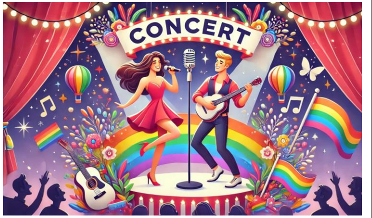
June 29th - Doors open 6:30 pm - Show at 7:00 pm